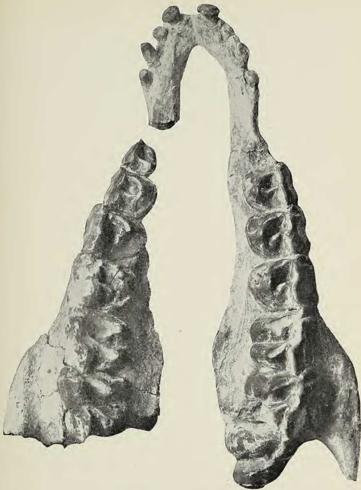
Hyracodon petersoni Wood. Type. C. M. Cat. Vert. Foss., No. 3572. Natural size.